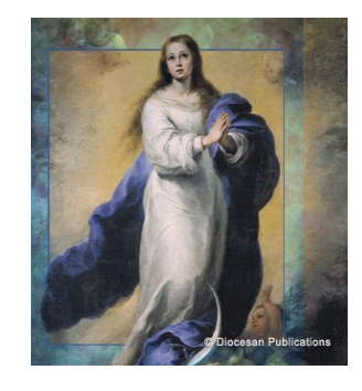
Immaculate Conception Holy Day of Obligation <u>Masses</u> Monday, December 9–9:00 a.m. & 7:00 p.m.