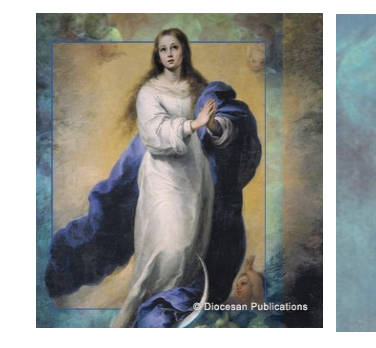
Immaculate Conception Holy Day of Obligation <u>Masses</u> Monday, December 9–9:00 a.m. & 7:00 p.m.